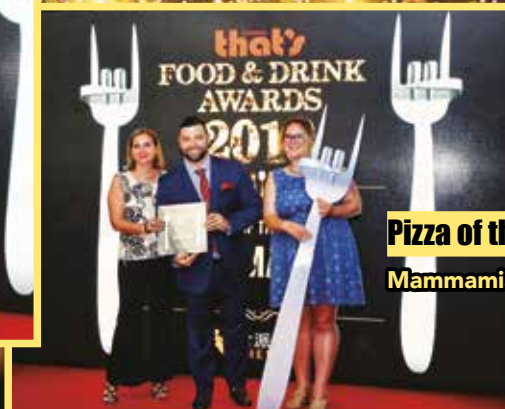
Pizza of the Year