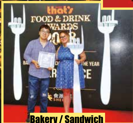
Bakery / Sandwich Eatery of the Year