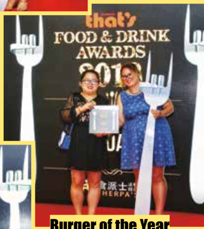
Burger of the Year