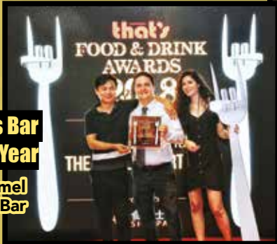
Sports Bar of the Year