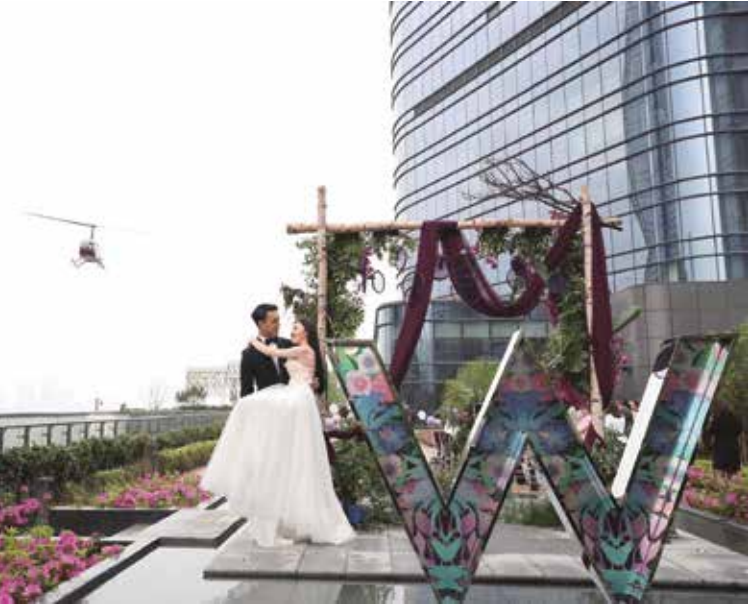
W Suzhou and several of the city's renowned wedding planning companies hosted a stylish wedding fair featuring three themes: Fashion Futuristic, Neon Love, and Dreamscape.