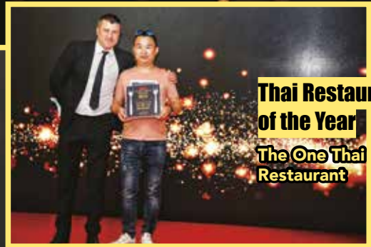
Thai Restaurant of the Year