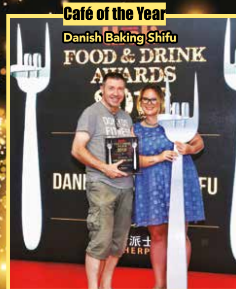
Café of the Year