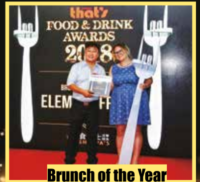
Brunch of the Year