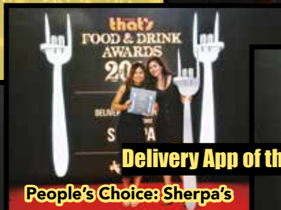
Delivery App of the Year