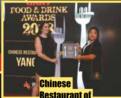
Chinese Restaurant of the Year