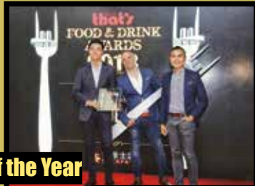
Hotel Bar of the Year WooBar, W Suzhou