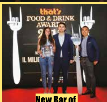
New Bar of the Year Il Milione Wine Lounge