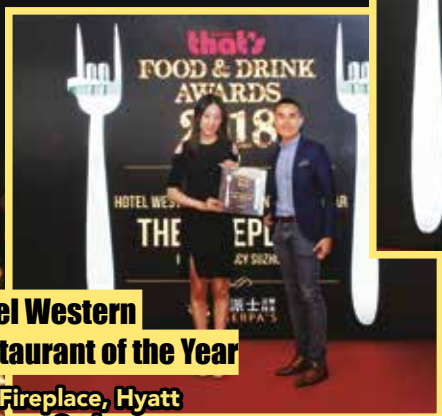
Hotel Western Restaurant of the Year