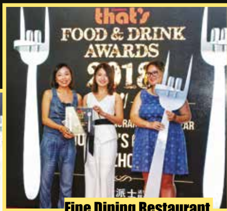
Fine Dining Restaurant of the Year