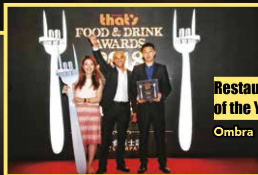
Restaurant of the Year Ombra

And of course a huge thank you goes to our sponsors: title sponsor Sherpa's; our hosts Toro Loco, W Suzhou; Summergate Fine Wines; Melvin Heyzeus Mexican Style Lager; Savanna Premium Dry Cider; Peddlers Gin; Rooty Moot; and all those generous enough to donate a prize for the lucky draw.