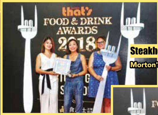
Steakhouse of the Year Morton's Grille Suzhou