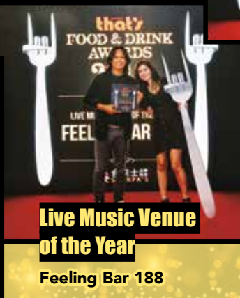
Live Music Venue of the Year