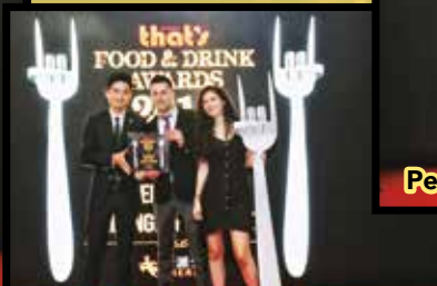
Cocktails of the Year