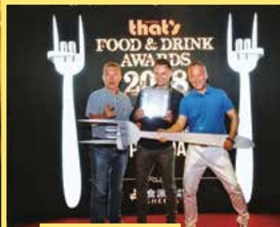
Club of the Year Pravda