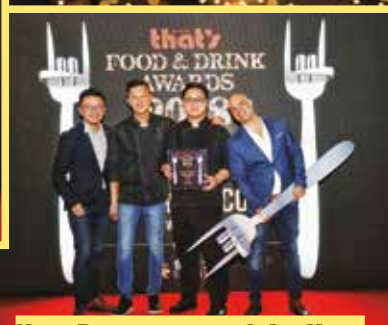
New Restaurant of the Year Toro Loco, W Suzhou