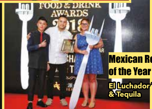
Mexican Restaurant of the Year