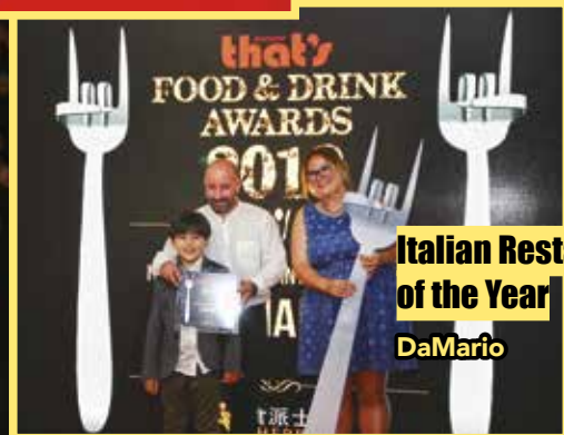
Italian Restaurant of the Year