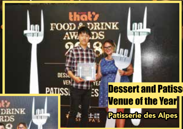
Dessert and Patisserie Venue of the Year