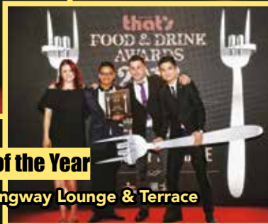
Bar of the Year Hemingway Lounge & Terrace