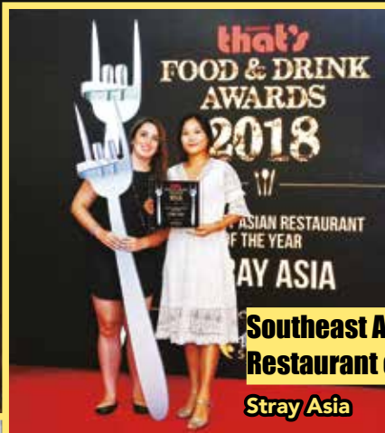
Southeast Asian Restaurant of the Year