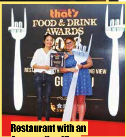
Restaurant with an Outstanding View