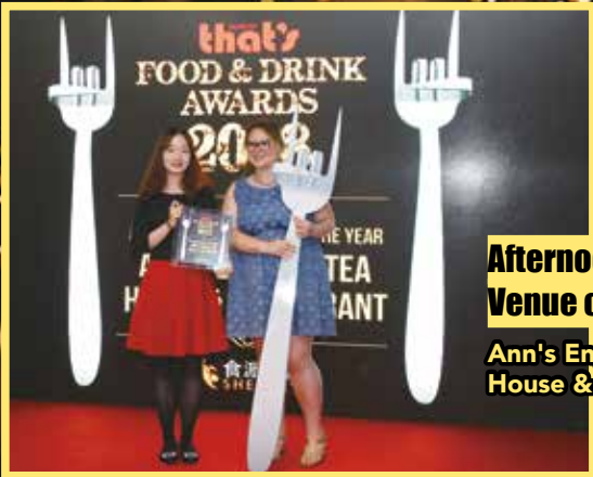
Afternoon Tea Venue of the Year