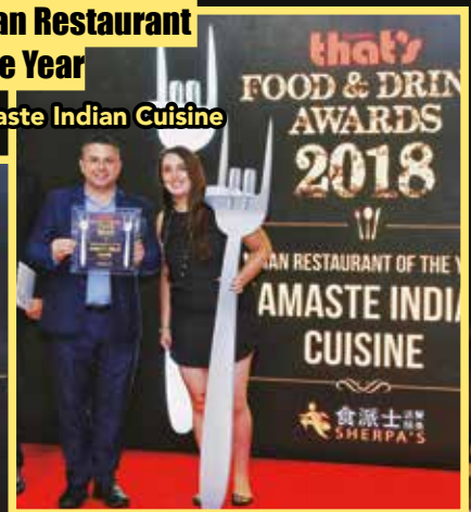
Indian Restaurant of the Year