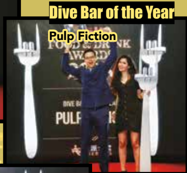
Dive Bar of the Year