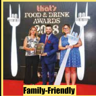
Family-Friendly Restaurant of the Year