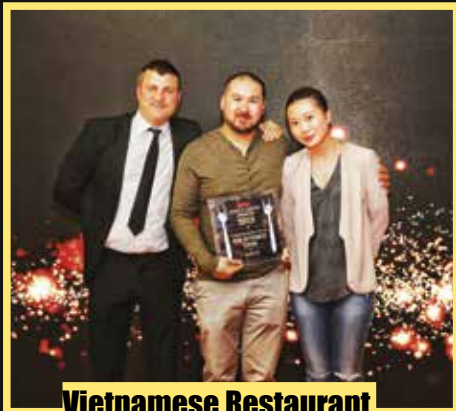
Vietnamese Restaurant of the Year