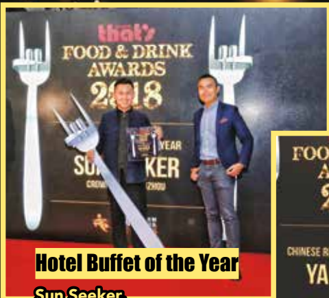
Hotel Buffet of the Year