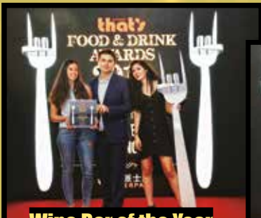
Wine Bar of the Year