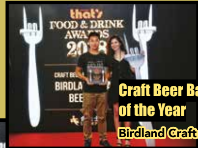
Craft Beer Bar of the Year